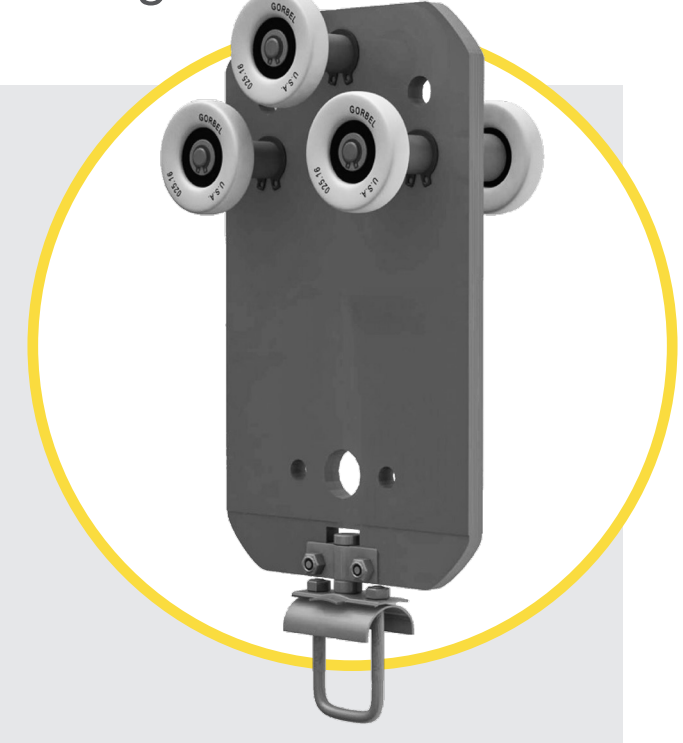
Maximum Trolley Capacity is 125 lbs.

These trolleys are designed for applications that require trolleys to resist kick-up and sideloading and are capable of supporting tools or heavy festooning combinations. Simply, these tool trolleys perform in applications where other trolleys can not.