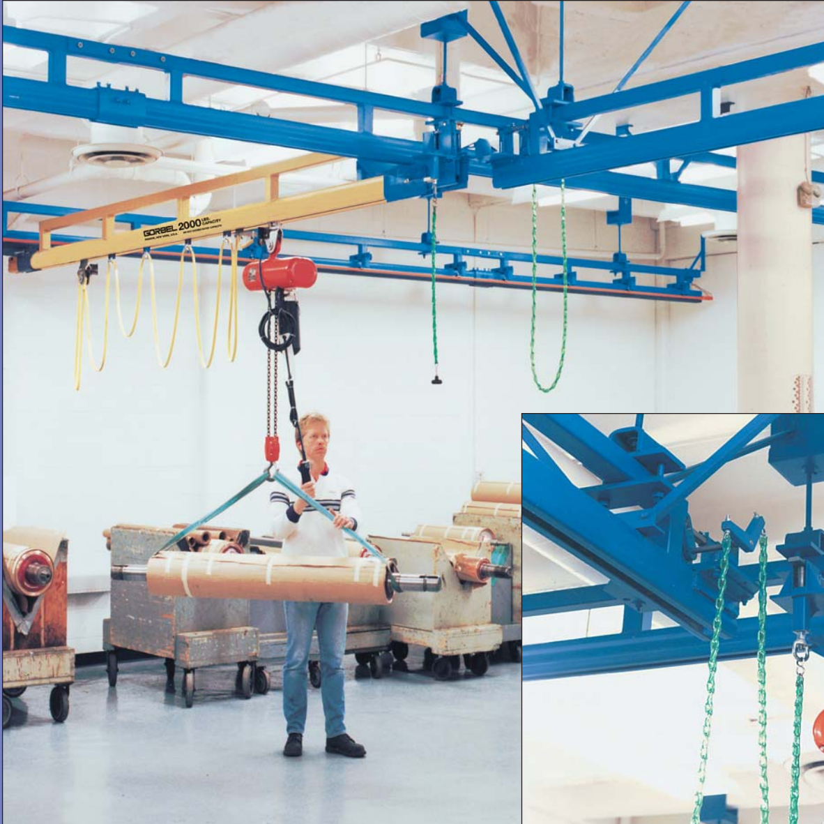
This view shows a close-up of Gorbelt Interlock/Transfer Cranes