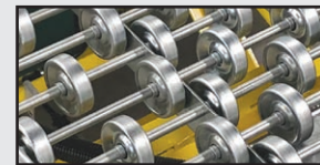
Gravity Skate Wheels on Destuff-it rear conveyor (for unloading)