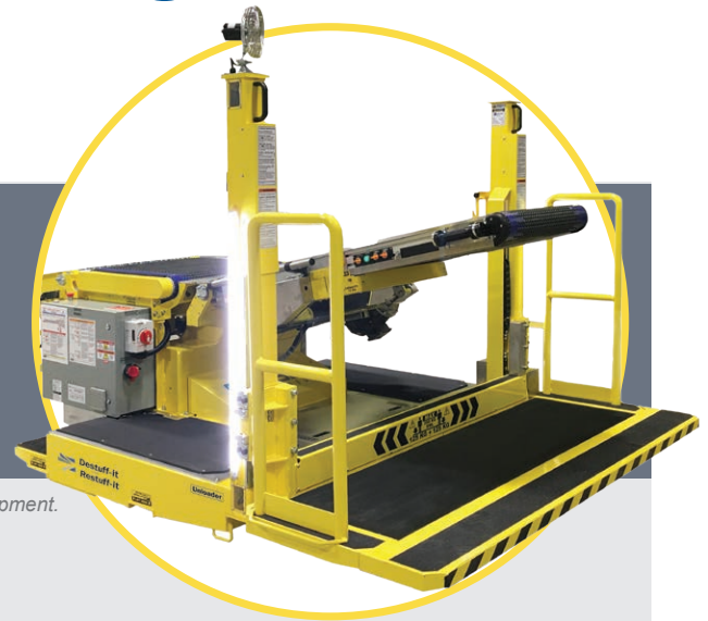
Image includes optional equipment.

Increase Productivity. Improve Safety. Promote Ergonomics.